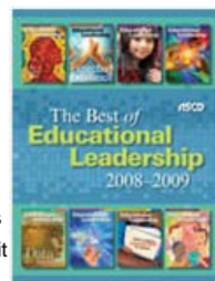
Online August 2009

Joyful learning can flourish in school—if you give joy a chance.